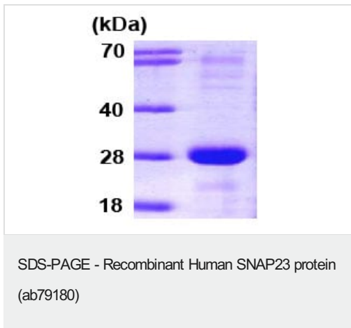
15% SDS-PAGE showing ab79180 (3µg).