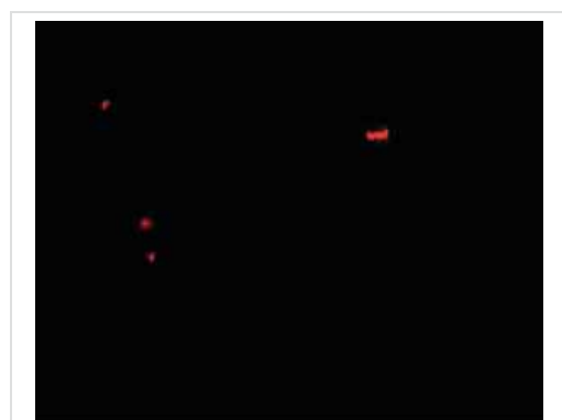
Immunofluorescence of Pannexin 1 in Human ovary tissue with ab139715 at 20 ug/mL.

Immunocytochemistry/ Immunofluorescence - Anti-Pannexin 1 antibody (ab139715)