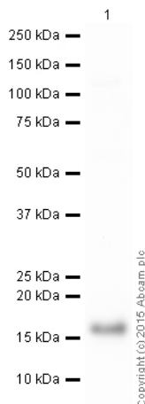
Western blot - HRP Anti-Galectin 7 antibody [EPR4287] (ab208508)

HRP Anti-Galectin 7 antibody [EPR4287] (ab208508) at 1/1000 dilution + Human skin tissue lysate - total protein ( ab30166 ) at 20 µg