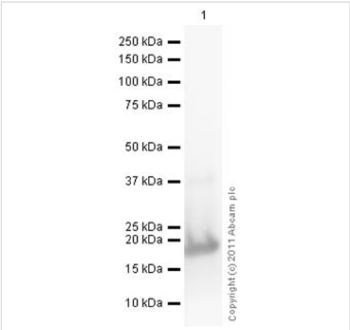
Western blot - Anti-G-CSF antibody (ab9691)

Anti-G-CSF antibody (ab9691) at 1 µg/ml + Recombinant human G-CSF protein ( ab73371 ) at 0.01 µg