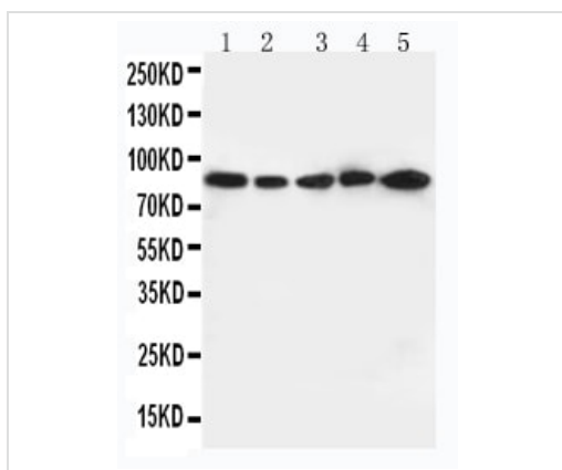
Western blot - Anti-CD18 antibody (ab131044)

Immunohistochemistry (Formalin/PFA-fixed paraffin-embedded sections) of Human Mammary Cancer Tissue at 1 µg/ml.