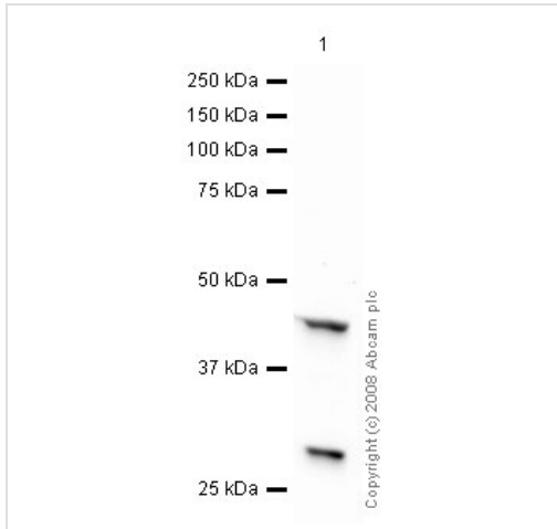
Western blot - Anti-ADIPOR1 antibody [mAbcam50675] (ab50675)

Anti-ADIPOR1 antibody [mAbcam50675] (ab50675) at 10 µg/ml + Human skeletal muscle tissue lysate - total protein ( ab29330 ) at 20 µg