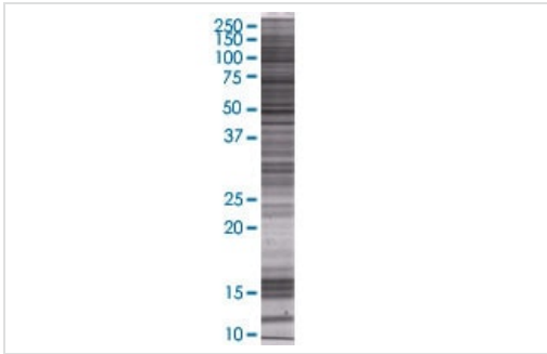
SDS-PAGE - Cathepsin G overexpression 293T lysate (whole cell) (ab94086)

ab94086 at 15µg/lane on an SDS-PAGE gel.