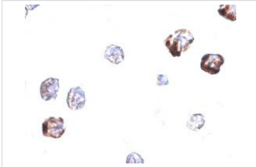
Immunocytochemistry of IRGC in A20 cells with ab106483 at 2.5 µg/ml.

Immunocytochemistry - Anti-IRGC antibody (ab106483)