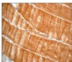
Immunohistochemistry (Formalin/PFA-fixed paraffin-embedded sections) - Anti-ACTN3 antibody [EP2531Y] (ab68204)

(Immunocytochemistry/immunofluorescence). Cells were fixed with paraformaldehyde, permeabilized with saponin and blocked with 5% serum for 15 minutes at room temperature. Samples were incubated with primary antibody (1/100) for 16 hours at 4°C. An Alexa Fluor® 568-conjugated goat anti-rabbit IgG polyclonal (1/1000) was used as the secondary antibody.