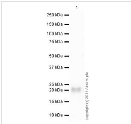
Western blot - Recombinant human TIMP1 protein (ab82104)

Please note: All products are "FOR RESEARCH USE ONLY. NOT FOR USE IN DIAGNOSTIC PROCEDURES"