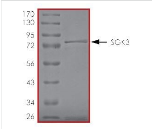
Functional Studies - Recombinant human SGK3 protein (ab55673)

The specific activity of SGK3 (ab55673) was determined to be 90 nmol/min/mg as per activity assay protocol.