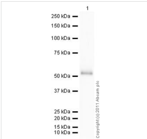
Western blot - Recombinant Human p27 KIP 1 protein (ab56279)

SDS-PAGE analysis of ab56279 with molecular weight markers. Approximate molecular weight 52kDa.