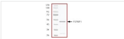
SDS-PAGE - Recombinant Human p27 KIP 1 protein (ab56279)

Standard curve for p27 KIP 1 (Analyte: ab56279); dilution range 1pg/ml to 1µg/ml using Capture Antibody Mouse monoclonal to p27 KIP 1 ( ab54563 ) at 1µg/ml and Detector Antibody Rabbit polyclonal to p27 KIP 1 ( ab7961 ) at 0.1µg/ml.