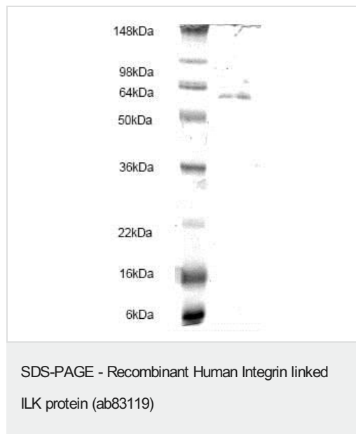
SDS-PAGE showing ab83119.