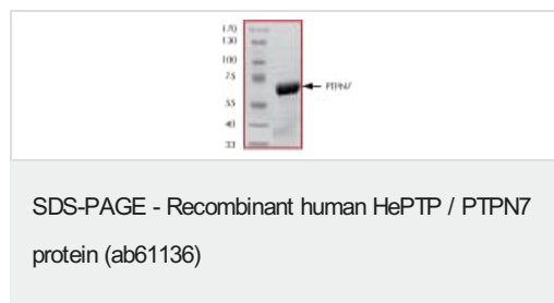
ab61136 on SDS-PAGE, MW ~67 kDa.

Please note: All products are "FOR RESEARCH USE ONLY. NOT FOR USE IN DIAGNOSTIC PROCEDURES"