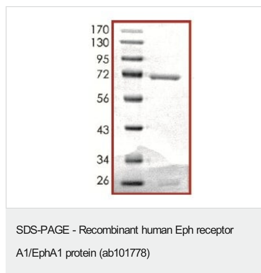
SDS-PAGE showing ab101778 at approximately 72kDa.