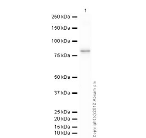
Western blot - Recombinant Human Cytochrome P450 3A4/CYP3A4 protein (ab114327)

SDS-PAGE analysis of ab114327 on a 12.5% gel stained with Coomassie Blue.