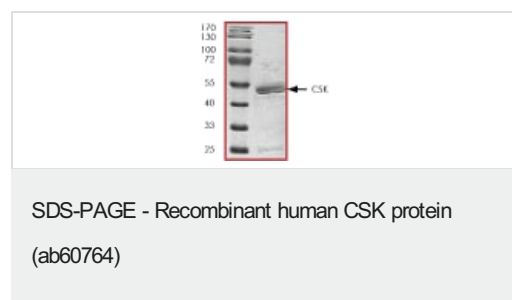
ab60764 on SDS-PAGE, MW ~52kDa.

Please note: All products are "FOR RESEARCH USE ONLY. NOT FOR USE IN DIAGNOSTIC PROCEDURES"