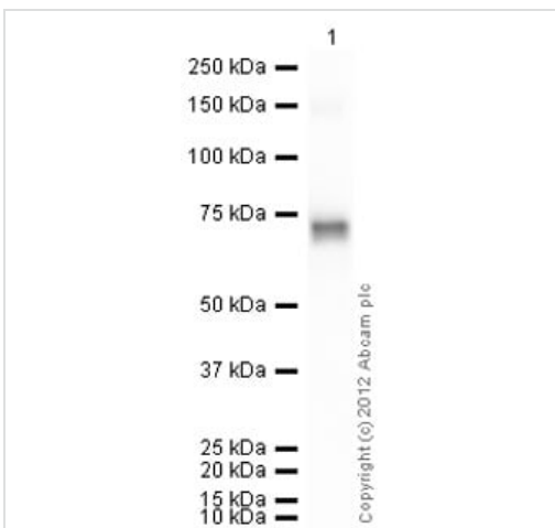
Western blot - Recombinant human CD105 protein (ab54338)

Standard Curve for CD105 (Analyte: CD105 protein (ab54338) ); dilution range 1pg/ml to 1ug/ml using Capture Antibody Mouse monoclonal [MEM-226] to CD105 (ab2529) at 5ug/ml and Detector Antibody Rabbit polyclonal to CD105 (ab21224) at 0.5ug/ml.