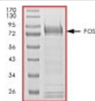
SDS-PAGE - Recombinant Human c-Fos protein (ab56280)

SDS-PAGE analysis of ab56280 with molecular weight markers. Approximate molecular weight 78kDa due to presence of a Tag.