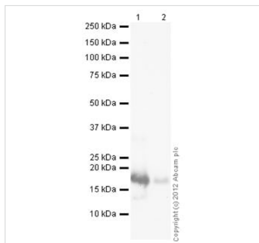
Western blot - Recombinant Human BMP5 protein (ab87627)

15% SDS-PAGE showing ab87627 at approximately 15.7kDa (3µg).