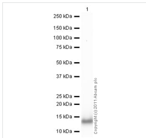
Western blot - Recombinant Human BMP2 protein (ab87065)

All lanes : Anti-BMP2 antibody ( ab17885 ) at 0.1 µg/ml