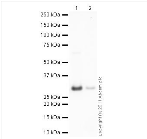
Western blot - Recombinant Human 14-3-3 zeta protein (ab85268)

Please note: All products are "FOR RESEARCH USE ONLY. NOT FOR USE IN DIAGNOSTIC PROCEDURES"