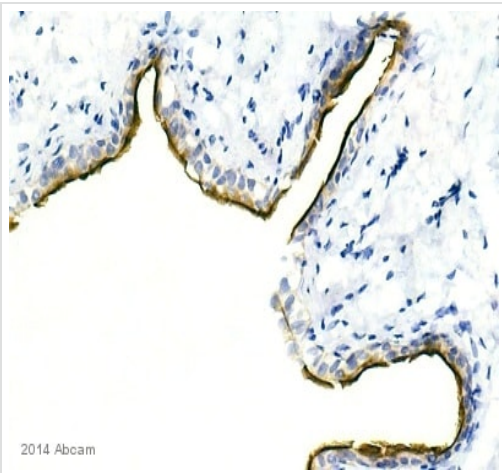
Immunohistochemistry (Formalin/PFA-fixed paraffin-embedded sections) - Anti-Uroplakin III antibody [SFI-1], prediluted (ab78197)

ab78197 staining Uroplakin III in mouse bladder tissue sections. Tissue was fixed in formaldehyde and heat-mediated antigen retrieval was performed using citric buffer. Blocking was performed with 1% BSA for 10 minutes at 21°C and ab78197 was used at 1/30 for 2 hours at 21°C.