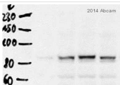
Western blot - Anti-Transferrin Receptor 2/TFR2 antibody (ab80194)