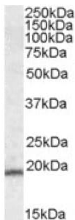
Western blot - Anti-TMS1/ASC antibody (ab2236)

Anti-TMS1/ASC antibody (ab2236) at 0.2 µg/ml + HeLa lysate