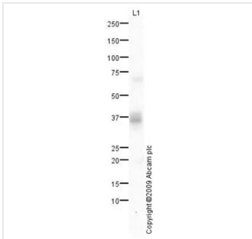
Western blot - Anti-Surfactant Protein A/PSAP antibody (ab87674)

Anti-Surfactant Protein A/PSAP antibody (ab87674) at 1 µg/ml + Lung (Human) Tissue Lysate at 10 µg