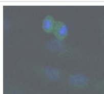
Immunocytochemistry/ Immunofluorescence - Anti-SIRT2 antibody (ab19388)

Immunohistochemistry (Formalin/PFA-fixed paraffin-embedded sections) analysis of SIRT2 showing staining in the cytoplasm of paraffin-embedded human heart tissue (right) compared to a negative control without primary antibody (left). To expose target proteins, antigen retrieval was performed using 10mM sodium citrate (pH 6.0), microwaved for 8-15 min. Following antigen retrieval, tissues were blocked in 3% H 2 O 2 -methanol for 15 min at room temperature, washed with ddH 2 O and PBS, and then probed with ab19388 diluted in 3% BSA-PBS at a dilution of 1/100 for 1 hour at 37°C in a humidified chamber. Tissues were washed extensively in PBST and detection was performed using an HRP-conjugated secondary antibody followed by colorimetric detection using a DAB kit. Tissues were counterstained with hematoxylin and dehydrated with ethanol and xylene to prep for mounting.