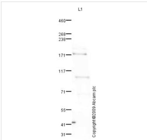
Western blot - Anti-SHPRH antibody (ab80129)

ICC/IF image of ab80129 stained SHSY5Y cells. The cells were 4% formaldehyde fixed (10 min) and then incubated in 1%BSA / 10% normal goat serum / 0.3M glycine in 0.1% PBS-Tween for 1h to permeabilise the cells and block non-specific protein-protein interactions. The cells were then incubated with the antibody (ab80129, 5µg/ml) overnight at +4°C. The secondary antibody (green) was Alexa Fluor® 488 goat anti-rabbit IgG (H+L) used at a 1/1000 dilution for 1h. Alexa Fluor® 594 WGA was used to label plasma membranes (red) at a 1/200 dilution for 1h. DAPI was used to stain the cell nuclei (blue) at a concentration of 1.43µM. This antibody also gave a positive result in 100% methanol fixed (5 min) SHSY5Y cells at 5µg/ml.