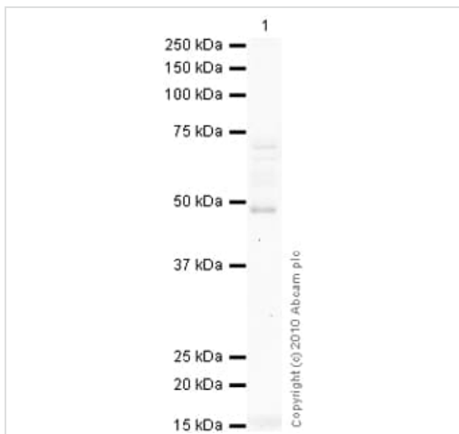
Western blot - Anti-SerpinB2/PAI-2 antibody (ab47742)

Anti-SerpinB2/PAI-2 antibody (ab47742) at 1 µg/ml + Human placenta tissue lysate - total protein ( ab29745 ) at 10 µg