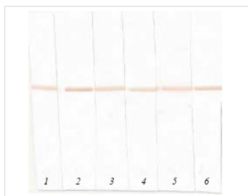
Western blot - Anti-NT-proBNP antibody [15F11] (ab13115)

WB detecting proBNP showing comparable detection from a range of antibodies available. Lane 1 - ab13111 [5B6], lane 2 - ab13115 [15F11], lane 3 - ab13059 [11D1], lane 4 - ab13124 [15D7], lane 5 - ab13122 [13C1], lane 6 ab13123 [24E11]. WB detecting proBNP showing comparable detection from a range of antibodies available. Lane 1 - ab13111 [5B6], lane 2 - ab13115 [15F11], lane 3 - ab13059 [11D1], lane 4 - ab13124 [15D7], lane 5 - ab13122 [13C1], lane 6 ab13123 [24E11].