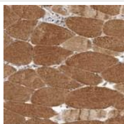
Immunohistochemistry (Formalin/PFA-fixed paraffin-embedded sections) - Anti-LRP5L antibody (ab122013)

Immunofluorescent staining of Human cell line U-251 MG shows positivity in nucleus but not nucleoli. Recommended concentration of ab122013 1-4 µg/ml. Cells treated with PFA/Triton X-100.