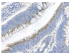
Detection of Gremlin 1 in human colon cancer tissue using ab22138 at 5 µg/mL.

Immunohistochemistry (Formalin/PFA-fixed paraffin-embedded sections) - Anti-Gremlin 1 antibody (ab22138)