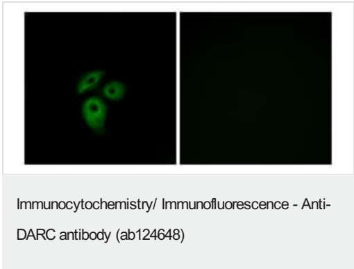
ab124648, at 1/100 dilution, staining DARC in A549 cells by Immunofluorescence. The image on the right is treated with the synthesized peptide.