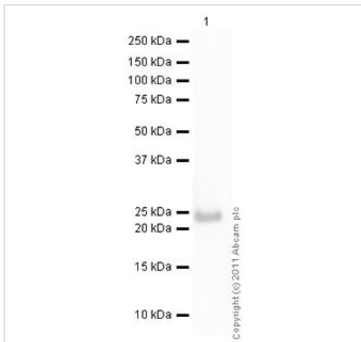
Western blot - Anti-C Reactive Protein antibody (ab78051)

We hypothesize that the 28 and 25 kDa bands represent the proform and mature form of C Reactive Protein, respectively.