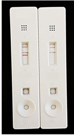
Lateral flow assay - Gold Conjugation Kit (20 nm, 20 OD) (ab188215)