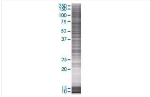
SDS-PAGE - HspBP1 overexpression 293T lysate (whole cell) (ab94320)

ab94320 at 15µg/lane on an SDS-PAGE gel.