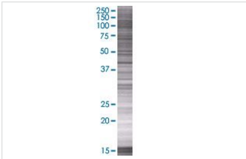
SDS-PAGE - Carboxypeptidase A overexpression 293T lysate (whole cell) (ab94084)

ab94084 at 15µg/lane on an SDS-PAGE gel.