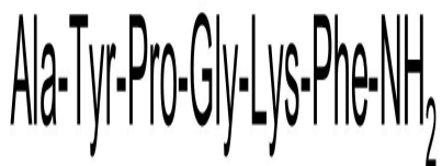
Chemical Structure - AY-NH 2 , PAR4 agonist peptide (ab120179)

2D chemical structure image of ab120179, AY-NH 2 , PAR4 agonist peptide