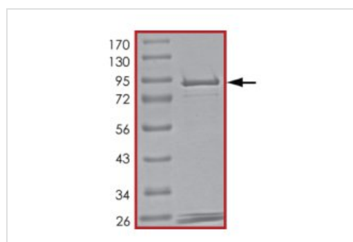
SDS-PAGE analysis of ab125545.

SDS-PAGE - PDE3A protein (Tagged) (ab125545)