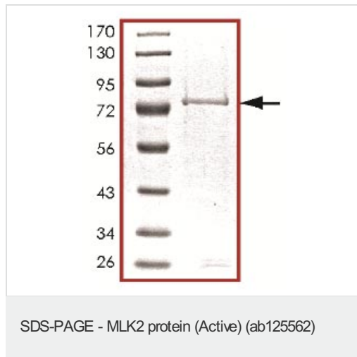
SDS-PAGE analysis of ab125562.